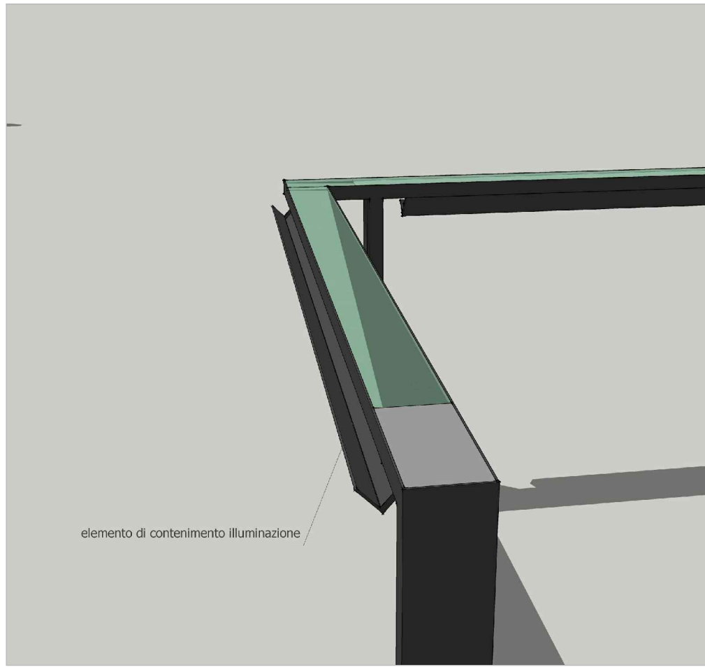
309 ALA 6 disegno E011 pot 7